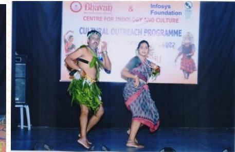
Episode No. 179 Hum Honge Kamyab Ek Din