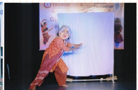
Episode No. 176 Rebati Ehati Sebati