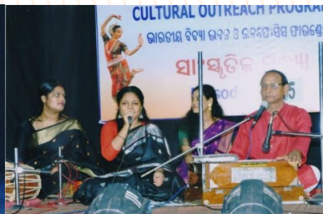
Episode No. 175 Pali Sangeet - Chanda, Champu