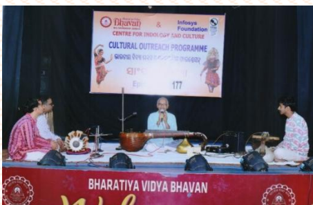
Episode No. 177 Bina Badan