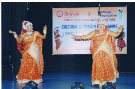
Episode No. 174 Bharat Leela

Between July and September 2025 , six new episodes were conducted, each highlighting unique aspects of Odisha's cultural landscape from folk music and dance to maritime rituals and crafts.