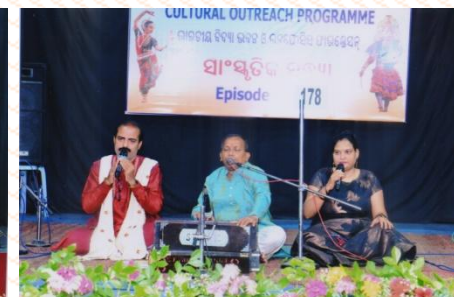
Episode No. 178 Traditional Music of South Odisha